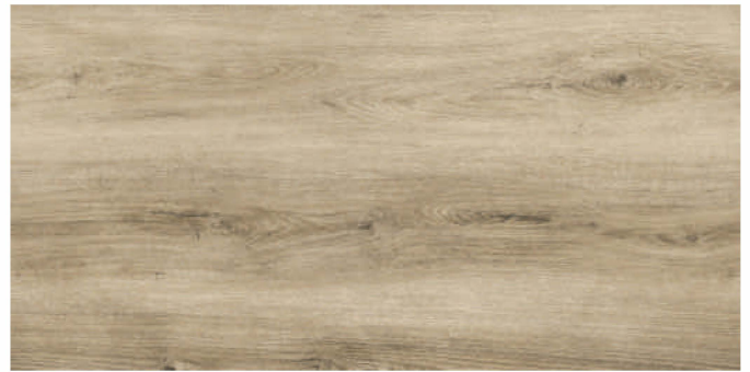
LIGHT GREY OAK